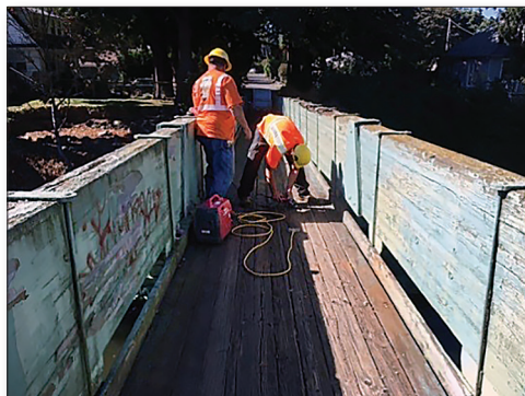
119th Street pedestrian bridge

Currently, City staff is analyzing coating products to find one that will adhere to the wood structure without peeling. A consultant is performing a brief study on the best type of paint system to apply to the bridge. The bridge is anticipated to be painted in the summer of 2017.