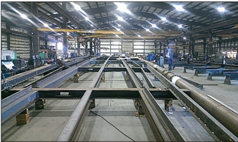
Pedestrian bridge fabrication in Arlington, WA

Under construction since August 2016, this project's contractor is currently building the abutment and bridge span on the west side of the Green River. Off-site in Arlington, the 220 feet of main bridge span is being fabricated. The new main bridge span is anticipated to be set in place atop the two piers by June 2017, resulting in a partial or full closure of West Valley Highway for about eight hours to accommodate the bridge setting operation. Remaining construction is scheduled to be completed by the end of 2017.